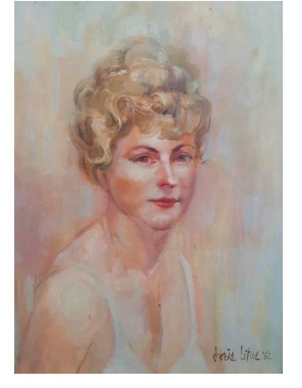
Top: Untitled (portrait of a woman), 1962, oil on board.

Right: Untitled (green abstract), 1962, oil on board.