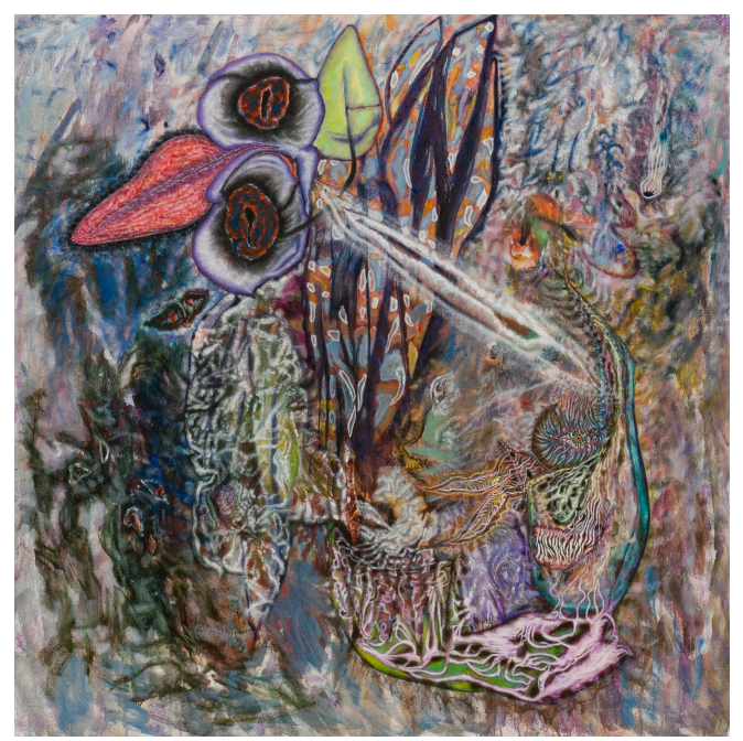
glaring hole, oil on canvas, 48 x 48 inches, 2023

becoming in Western philosophy is deeply rooted in normative and binary constructions. What queering the concept of becoming does, rather, is encourage a turn towards a passive kind of vitalism that embraces the non-desirable, the counterproductive, and the unresolved, in favour of rejecting conceptions of becoming that resent deviance, incongruities, and inconsistencies.8 To experiment with queer (un)becoming, Halberstam invites us to put our trust in masochistic pleasure because it, "precisely references the space in between and refuses to respect the boundaries that usually delineate self from other."9 To this, Elizabeth Freeman adds in Time Binds that masochism, as a mode of depersonalization, also affects normative time; it is a practice that most self-consciously uses the body to, "alter the flow of time."10 The way Neudorf approaches fragmentation recalls the masochist's aim to rewrite one's bodily history, "so that there is an 'after' to violence appearing as 'before."11