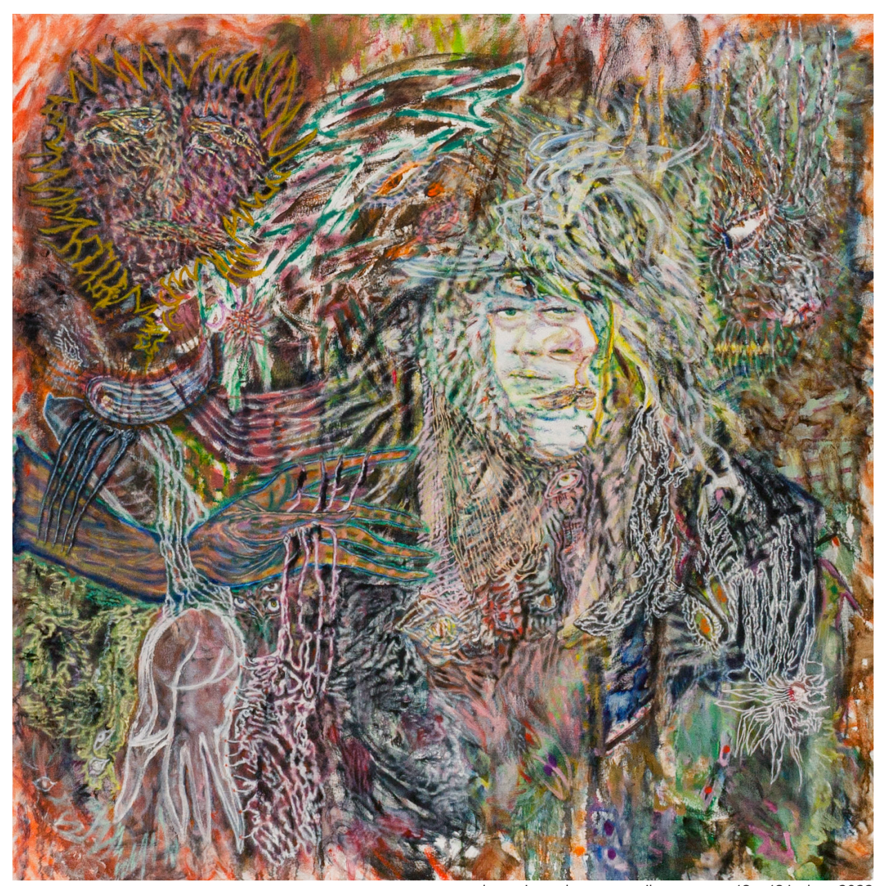
my dream is on the screen, oil on canvas, 48 x 48 inches, 2023