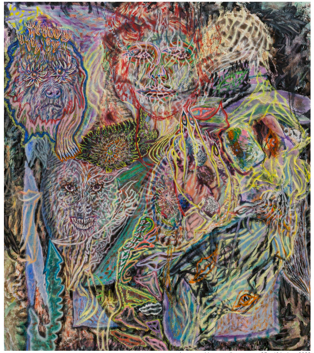
the same old scene, oil on canvas, 35 x 40 inches, 2023