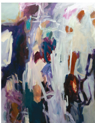
Becky Fixter, Whimsy , 2018, acrylic on canvas, $1,250.00