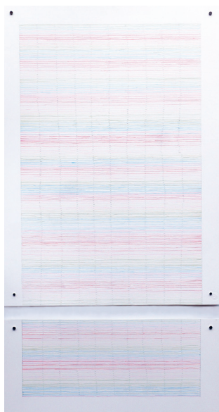
Lydia Burggraaf, Edinburgh Postnatal Depression Scale (detail) , 2018, coloured pencil on paper, $2,000.00