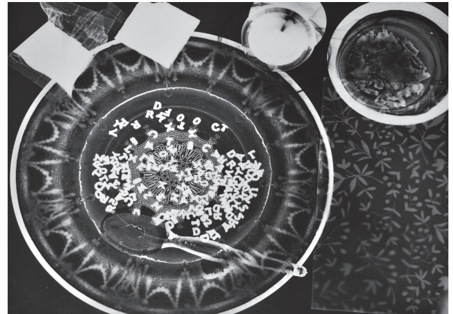
Scott Taylor, Blue Plate Special: Anagram Soup , 2022. 11" x 14", silver gelatine