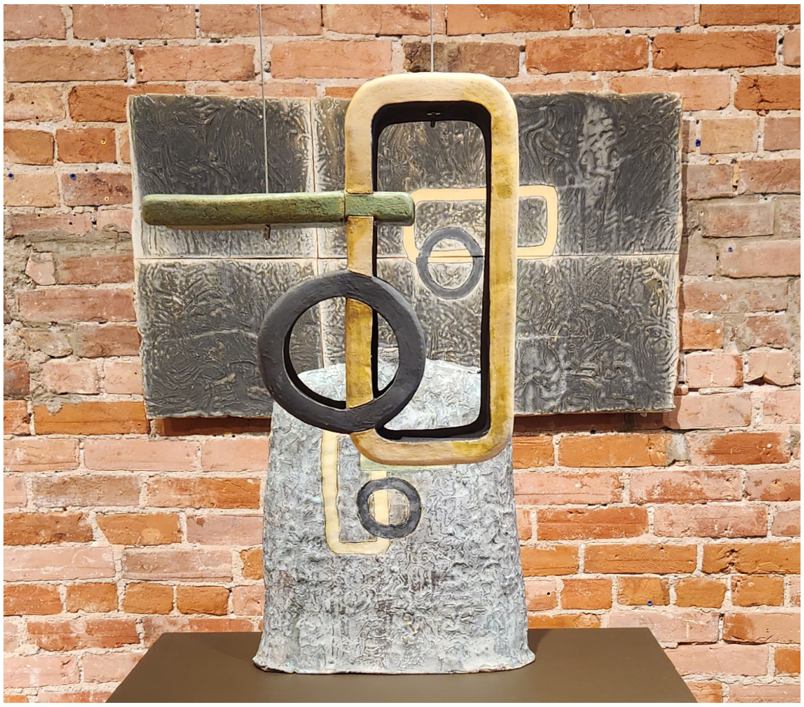
Trimorphism Installation View, ARTspace Gallery

One mainstay of Grenier's practice is the research and development of new and unusual surface treatments utilizing atypical materials and combinations that are rarely employed. This results in surface crusts that reveal the inherent qualities of these materials, producing an often-unexpected depth and rich tactility. Grenier is not alone in this quest. With the ebullient resurgence of ceramics of the past decade, he is in sync with other ceramists worldwide, carving new paths in the field.