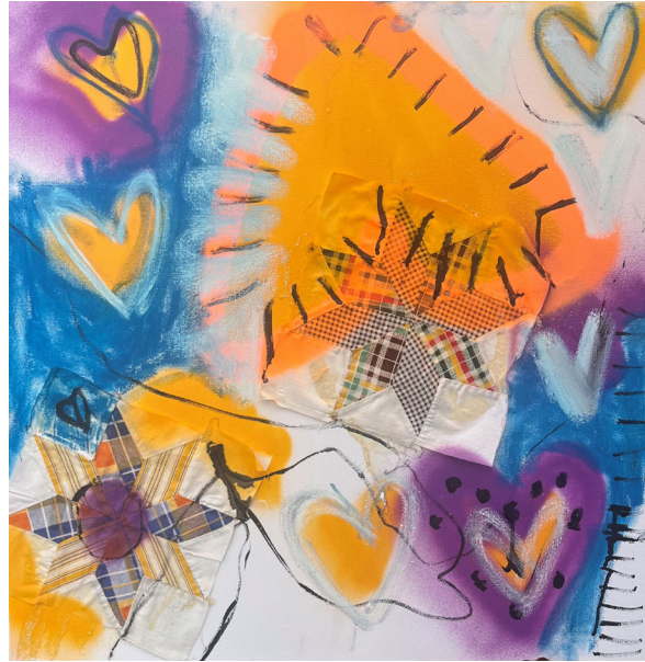
Stars are hearts that beat soundlessly, 2022; mixed media on canvas

The quilt pattern made over and over is a star; stars are long-dead beacons of light in the night sky. Our ancestors are long-dead beacons of origin or light as well. Where did we come from? How can we feel connected to our ancestors and those who came before us?