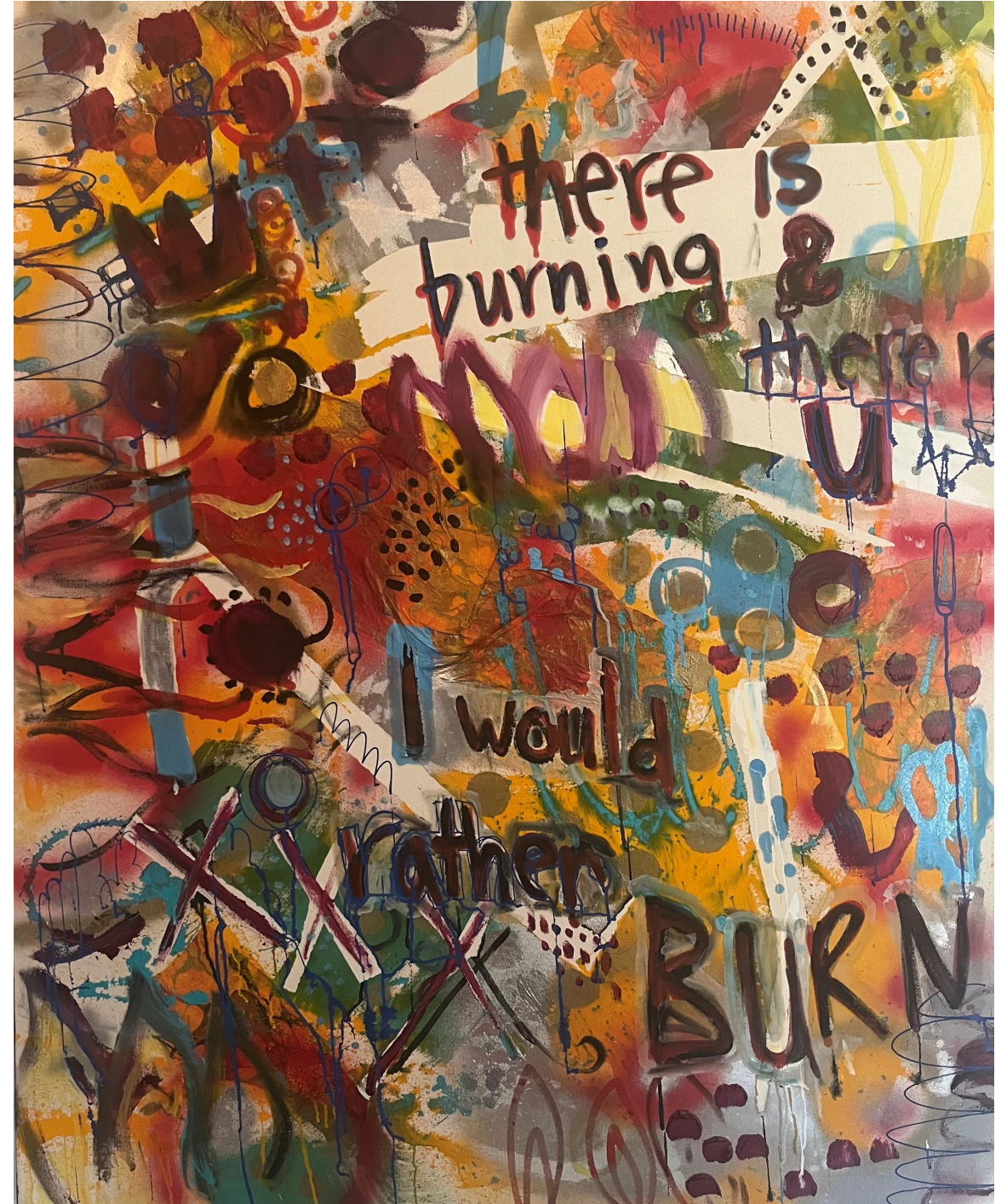
There is a burning and there is you / I would rather burn, 2018; mixed media on canvas

Each square is unique, and no pattern has been repeated, yet they are all part of what was intended to be a comforting quilt. Just like a family is stitched together through the inclusion and exclusion of people, the fact that this never did become a quilt reminds the viewer that blood cannot be the only thing that ties us together; there is sweat, there are tears, and there is hope that what is to come will be better than what has been.