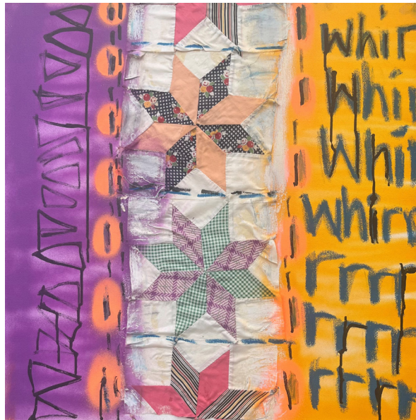
Whirr whirr whirr, 2022; mixed media on canvas

The juxtaposition of the stars with a bright, modern day colour palette weaves a story started nearly 100 years ago with our lives of today.