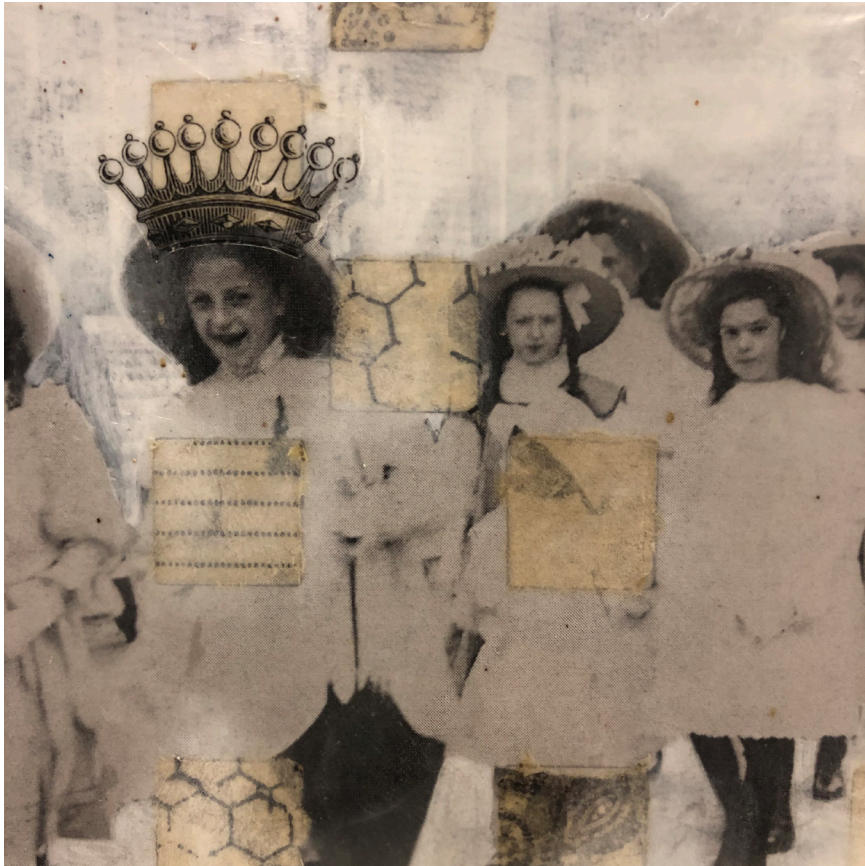
Crystal Benallick, Inside Joke , 2022. Encaustic mixed media, 6" x 6"