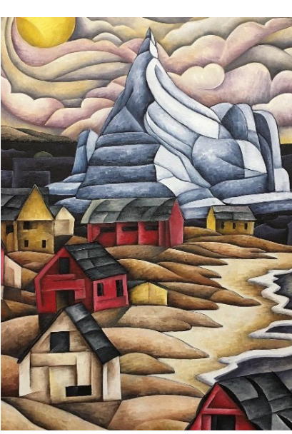
Iceberg Over Fishing Village, 2022. 18"x24": oil on canvas