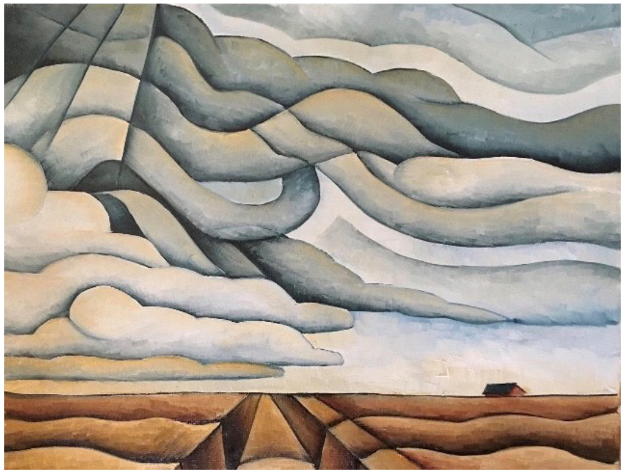
Storm Incoming Over Chatham Field, 2022. 7"x9": oil on canvas