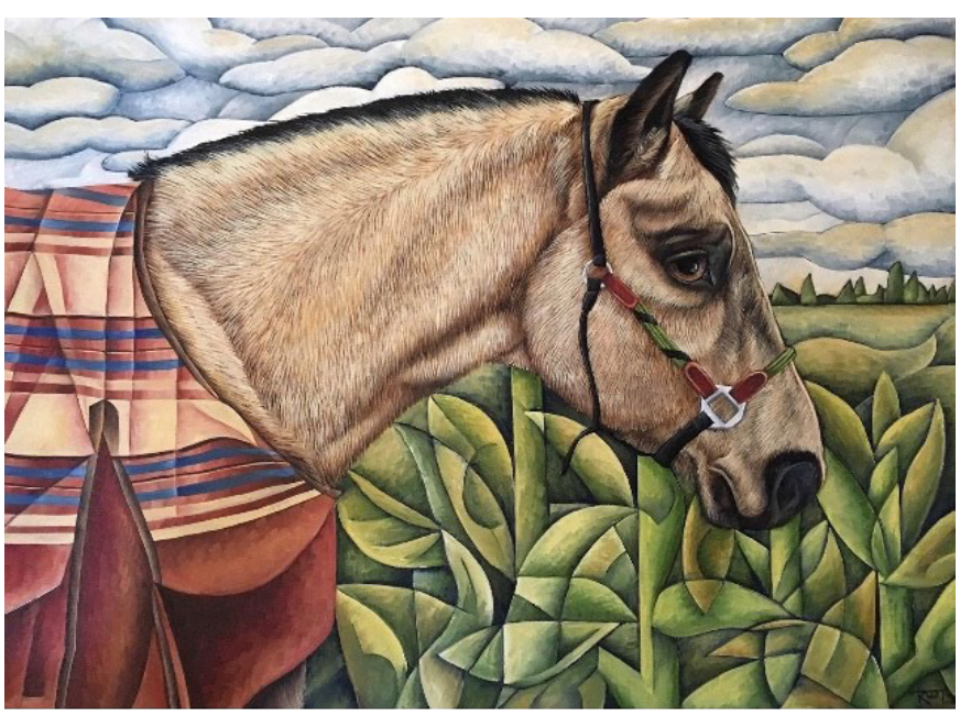
Frank, 2022. 18"x24": oil on canvas