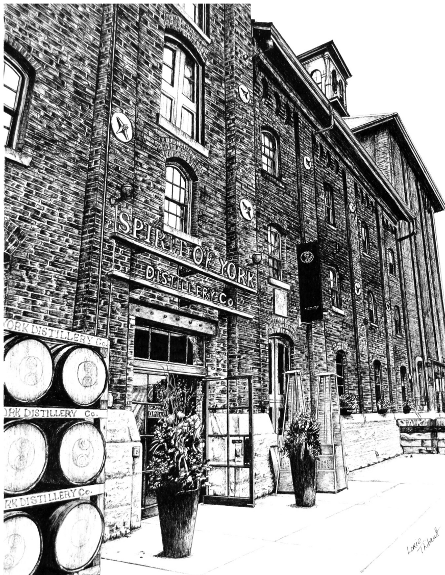
Spirit of York - Toronto, Ontario, 18" x 21"; pen and ink