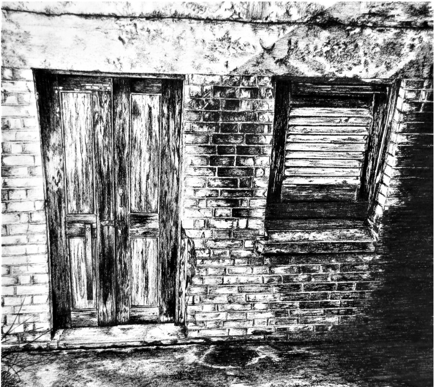
Her/His Majesty – Royal Naval Dockyard, Bermuda, 2020: 17.5" x 17.75"; pen and ink

Like many artists who work with pen and ink, Lorie Thibault describes her process as both pleasurable and trance-like. She speaks about the studio as an escape from the commonplace pressures typical of daily life and a way to embrace memory and possibility. Pen-strokes pass by like roadside markers as drawings emerge and finally arrive like the destinations she depicts: architecture, village scenes, and landscapes, sometimes solid and real; at other times emerging from a state of roadside drift; a glimpse into a reality that pulls the viewer into ambiguity. Do we know this place? Do we remember? Do we imagine?