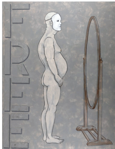
Free, 2018; 48" x 60" Acrylic on canvas