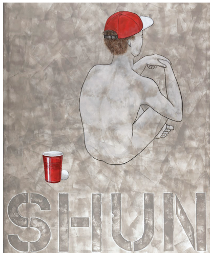
Shun, 2019; 48" x 60" Acrylic on canvas

However we may experience the implications set out in each canvas, in this body of work the artist shows us a symbolic and code-based representation of communication and its failures, confronting the spaces between the language the artist adopts and our reading of the work presented. Ultimately, we are left with a sense of how vulnerable communication can be and how human it is that we should continue to search it out.